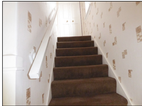
Staircase leading up First Floor