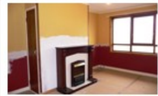
Living Room pic 1

HALLWAY (T-shaped Approx. 0.94m x 3.13m at longest and 1.18m x 3.10m); leading to all rooms; built in cupboard with shelves (approx. 0.79m wide); storage heater; one double socket.