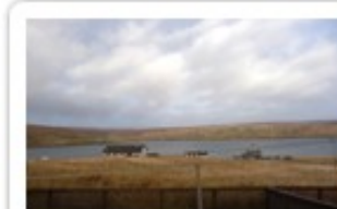
View over Mid Yell Voe

GARDEN Front and rear gardens which are bounded by timber fencing; large washing line with views across to Camb.