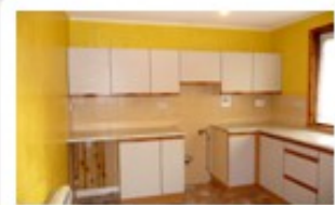
Kitchen pic 1

KITCHEN (Approx. 3.04m x 3.36m); Large window facing south; vinyl flooring; dimplex electric storage heater;