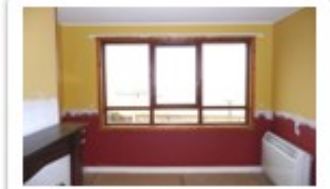
Living Room pic 3

KITCHEN (Approx. 3.04m x 3.36m); Large window facing south; vinyl flooring; dimplex electric storage heater;