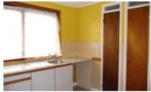
Kitchen pic 2