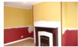
Living Room pic 2

LIVING ROOM (Approx. 4.42m x 3.33m at widest); Spacious room with large window facing north; large dimplex electric storage heater; built in cupboard containing hot water tank; free standing electric fire and over mantle in dark wood; two telephone points; three double sockets.