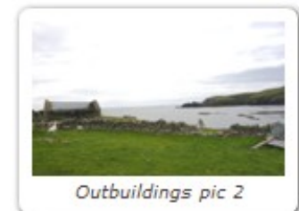
Outbuildings pic 2

LARGE SHED (Approx. 20m x 5.1m); Containing milking parlour with 10 stalls, power, lighting and water supply.