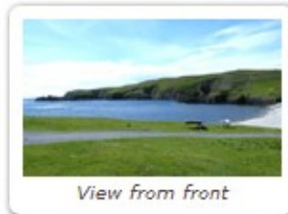
View from front

GARDEN Substantial garden area mainly to the north-east of the property enclosed by a wooden fence/stone wall; Further garden area to the south-west of the property enclosed by a stone wall.