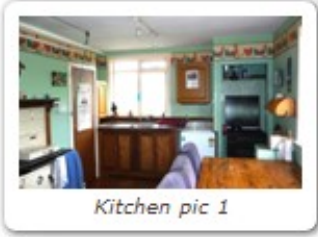
Kitchen pic 1

KITCHEN (Approx. 3.3m x 4.91m); Large window facing south-east and one window facing north-west; spacious room with some built in units; Rayburn Regent oven; built in shelved cupboard which holds the immersion tank; built in larder; storage heater; cork tiled floor; leads off to:-