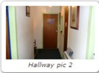
Hallway pic 2

ENTRANCE HALL (Approx. 1.23m wide); L-shaped and carpeted; small built in shelved linen cupboard; one electric storage heater; telephone point.