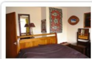
Bedroom 1 pic 2

BEDROOM 2 (Approx. 3.58m x 3.36m); Large window facing north-east and small window facing south-east; fitted carpet; small dimplex panel heater; built in cupboard with hanging rail and storage area; television point and two double sockets.