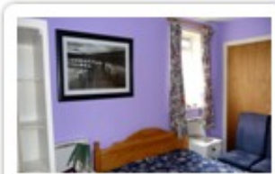
Bedroom 2 pic 1

BEDROOM 2 (Approx. 3.58m x 3.36m); Large window facing north-east and small window facing south-east; fitted carpet; small dimplex panel heater; built in cupboard with hanging rail and storage area; television point and two double sockets.