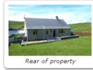
Rear of property

Other Features There is also a derelict croft house, a stone built chicken house and an 18th century two-storey Haa building which could be renovated. All these buildings are adjacent to the croft house.