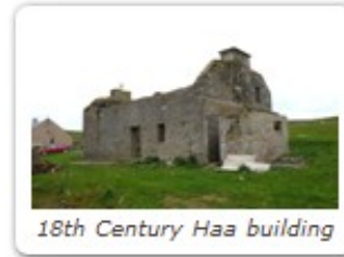
18th Century Haa building

BEDROOM 1 (Approx. 3.17m x 3.09m); Large window facing south-west with undisturbed views out to Funzie; fitted carpet; small dimplex panel heater; built in cupboard with hanging rail; three double sockets.