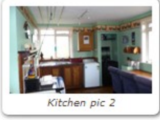
Kitchen pic 2

KITCHEN (Approx. 3.3m x 4.91m); Large window facing south-east and one window facing north-west; spacious room with some built in units; Rayburn Regent oven; built in shelved cupboard which holds the immersion tank; built in larder; storage heater; cork tiled floor; leads off to:-