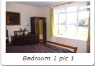
Bedroom 1 pic 1

BATHROOM (Approx. 1.93m x 2.33m); Small window facing north-east; three piece bathroom suite comprising bath, sink and toilet; vinyl flooring; tiled walls; heated towel rail.