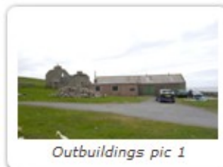
Outbuildings pic 1

GARAGE/WORKSHOP (Approx. 4.5m x 9.5m); With complete fan driven forge, bench and anvil; Power, lighting and water supply.