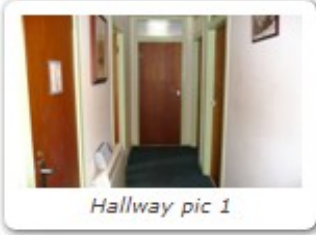
Hallway pic 1

FRONT PORCH/CONSERVATORY (Approx. 2.42m x 2.7m); Enjoying beautiful views to the south-west over the pebble beach of Funzie; wooden floor