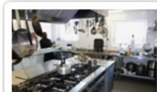
Kitchen pic 2

10 Burner gas hob with extractor hood over; three ovens (one double, one single), double hot cupboard, double sink, single sink and separate hand wash basin, all in stainless steel; Toaster/griller; Panini maker; microwave oven; dish washer; wall and floor mounted storage units; Stainless steel work surfaces; cold meat slicer; magimix; scales; meat fridge; dairy fridge; smoke alarm; fire extinguishers; fire blanket; First Aid kit; Full range of pots, pans and kitchen utensils; paper towel dispenser; six wall mounted double sockets; (N.B. Global kitchen knives not included in sale)