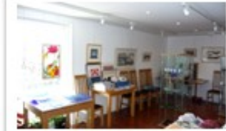
Gallery area pic 1

The room features a magnificent "Quarter Sixareen" glass topped counter made by local boat builder William Mouat (when viewed from certain angles it appears full size, from the use of mirrors);