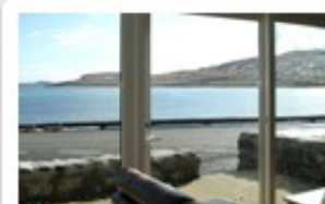
View from cafe

REAR VESTIBULE (Approx. 1.3m x 2.15m); contains a cupboard holding cleaning equipment; alcove with shelving and a double cupboard containing the hot water cylinder and low level stainless steel sink