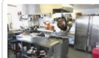
Kitchen pic 1

In a separate alcove there is an Acer PC with internet access, complete with keyboard, speakers and Lexmark combined Printer-Scanner-Copier