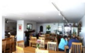
Main Cafe pic 1

Slate tiled hearth with solid fuel stove and elm overmantle; recessed spotlighting; bar; illuminated cold cabinet; illuminated display cabinet;