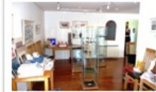
Gallery area pic 2

GALLERY (Approx. 3.1 x 7m); American white oak solid timber floor (stained); recessed spotlighting and separate tracked spotlighting; three display cabinets;