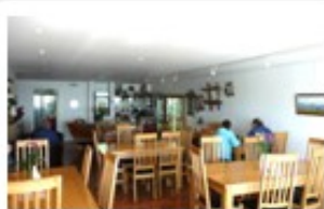
Main Cafe pic 2

American white oak solid timber floor (stained); three large timber tables and four smaller timber tables, 40 high backed timber chairs with leather upholstery (max. cover - 55); two three seater leather sofas and three leather club chairs; off-peak electric heating; four double powerpoints and two single powerpoints recessed into floor