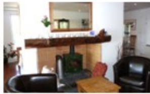
Hearth and Seating

ENTRANCE HALL (Approx. 3.5m x 1.9m); Double glazed timber outer door, carpeted, dimplex heater, notice board, window providing view into Cafe/Dining Room; access to toilet and separate toilet with wheelchair access; Glazed inner door leads to a large room comprising the Café and Gallery, the two being partly separated by the fire hearth and stone chimney