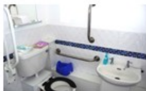
Disabled access toilet

TOILET (Approx. 1.4m x 1.25m); Attractively tiled; w.c., hand basin, mirror, hand towel dispenser;